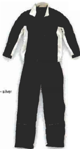
2831749 navy - off white - silver

Contrasting colour details of knitted polyester/lycra. 3M Scotchlite™ reflector trim on the front, back, sleeves and legs. YKK zippers. Cuffs with velcro. Jacket and trouser pockets with zippers. Elastic drawstring with stoppers in jacket waistband. Elastic and drawstring at the pants waistband. This jacket is unlined, the pants are lined with single knit jersey of cotton/polyester. The leg width can be adjusted with velcro. Half moon with embroidery. Size S-XXL