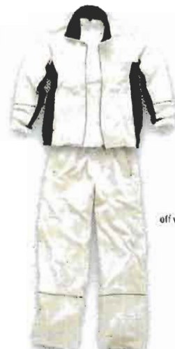
2831702 off white - black - silver