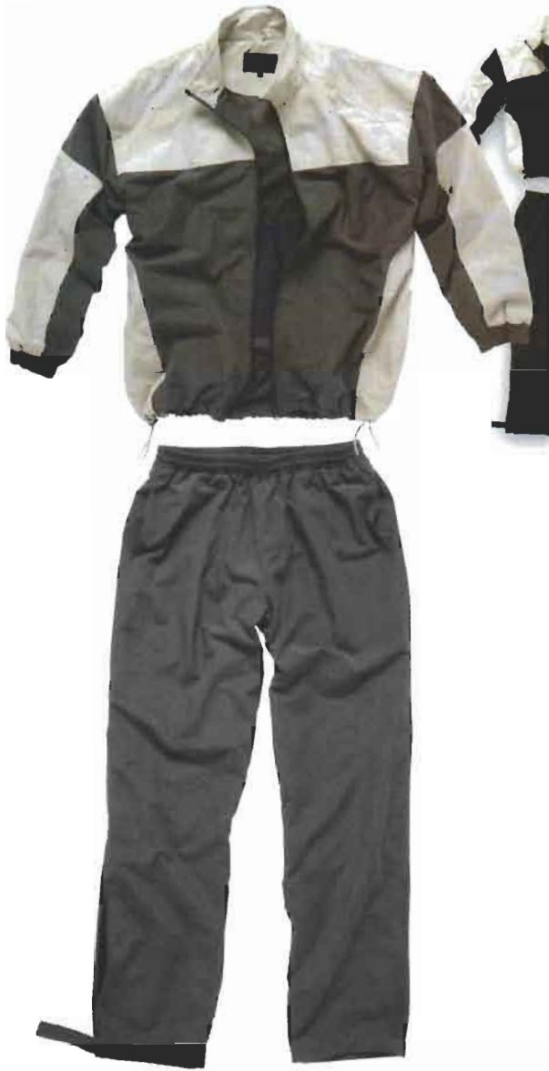
33S2190 grey - silver