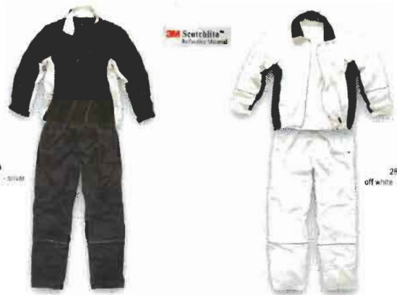
2831049 navy - off white - silver

Triacetate on the inside of the collar, cuffs and pants waistband. Reflector trim. Elastic drawstring with stoppers in jacket waistband. Elastic at the pants waistband. Velcro fastening at the cuffs, leg pockets and ankle. One inner pocket. Open pockets at the front of the pants. YKK zippers in the jacket, back pocket and at the ankle. Half moon with embroidery. Zipper in the back lining. Size S-XXL