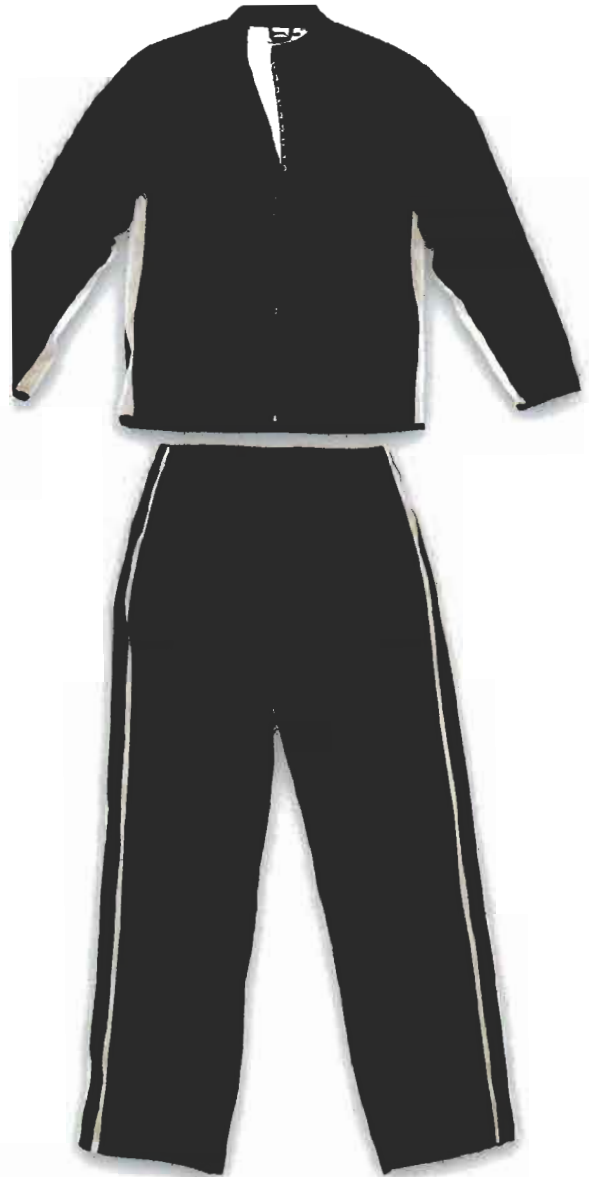
3362099 black - ecru

Fabric of 70% cotton / 30% nylon with peach finish. Size S-XXL