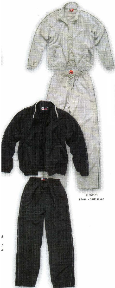
3175V98 silver - dark silver

Van alle merken ziet u een gedeelte uit de collectie heeft u speciale wensen mail naar galjoen voor een advies.