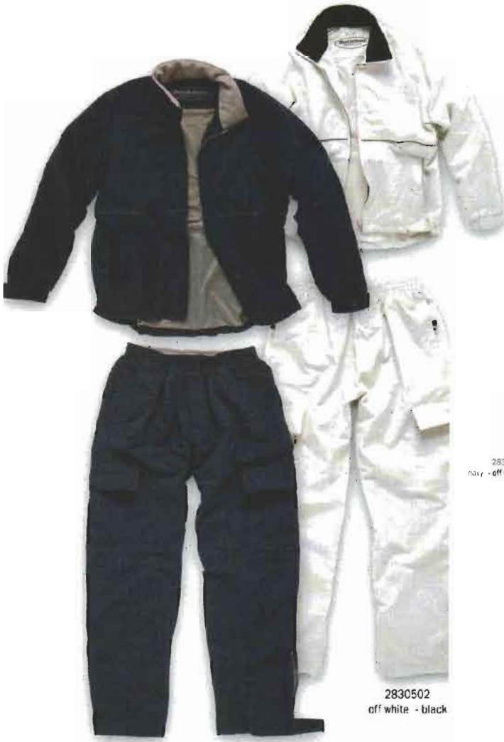
2830549 navy - light grey